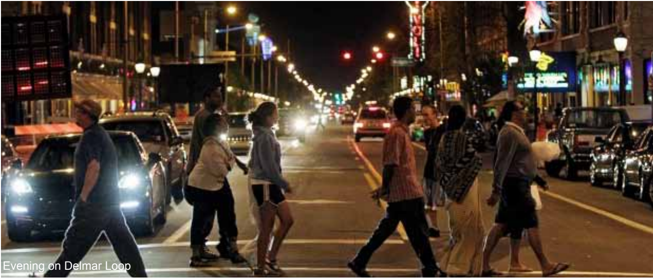
Evening on Delmar Loop