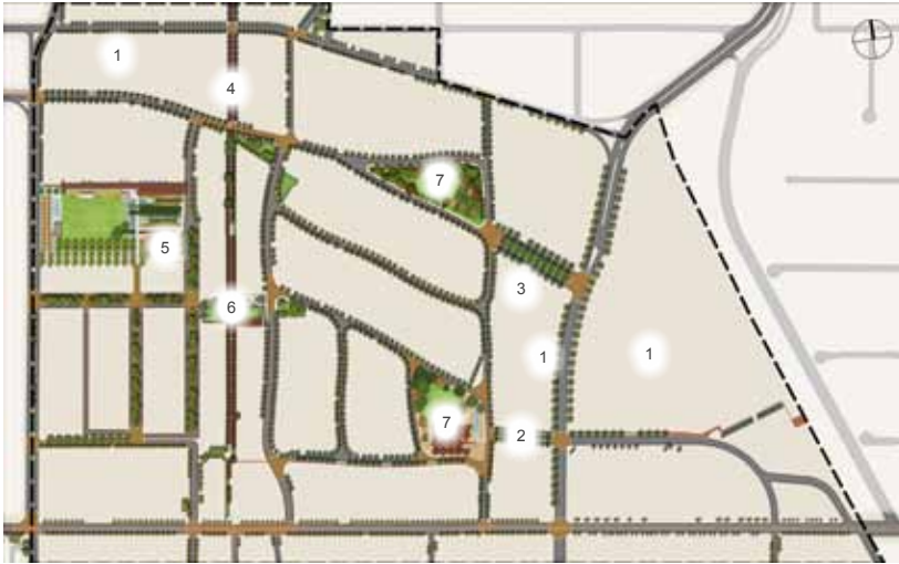
Figure 3.1: Parkview Gardens Parks and Open Space Plan (Adopted 2010)