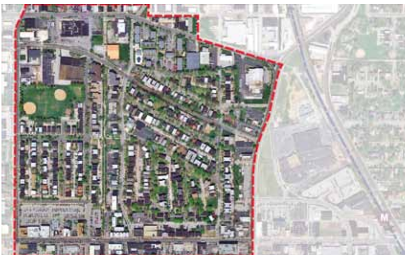
Figure 3.2: Detail Plan Area

probable cost); RHCDA (evaluation and outcome measurement reporting); Trailnet (neighborhood walk/bike audit); and 501 Creative (marketing and communications.)