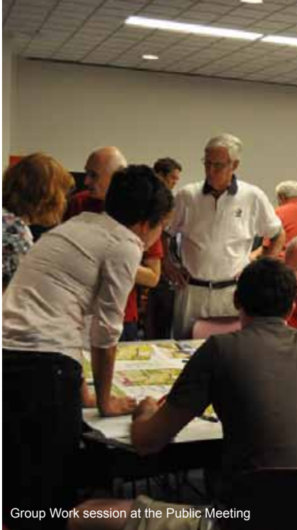
Group Work session at the Public Meeting

Connecting residents to existing and planned modes of transit is a major component of sustainable neighborhood development and a stated requirement of the grant award. Therefore, the project Study Area (Figure 3.2) incorporates the existing Delmar MetroLink station, extending one half block north of Olive Boulevard (north) to one half block south of Delmar (south) and from the centerline of Hodiamont Avenue (east) to one half block west of Kingsland Avenue (west). This study area includes the Parkview Gardens neighborhood as well as Washington University’s North Campus, University City’s Civic Center and part of the Cunningham Business Park. Since planning for these three areas does not fulfill the project goals, a smaller Detail Plan Area was established within the Study Area. The Detail Plan Area extends from one half block north of Olive Boulevard (north) to one half block south of Delmar (south) and from the centerline of North Skinker Boulevard (east) to the centerline of Kingsland Boulevard (west) (Figure 3.2, page 45) The Study Area sits within a larger Context Area that extends from roughly Etzel Avenue to the north, Forsyth Boulevard to the south, Hamilton Avenue to the east, and Big Bend Boulevard to the west. This Context Area covers all adjacent regional connections and amenities that are relevant to the Neighborhood Sustainable Development Plan (See Figure 1.1, page 41.)