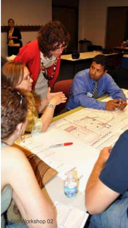
Public Workshop 02