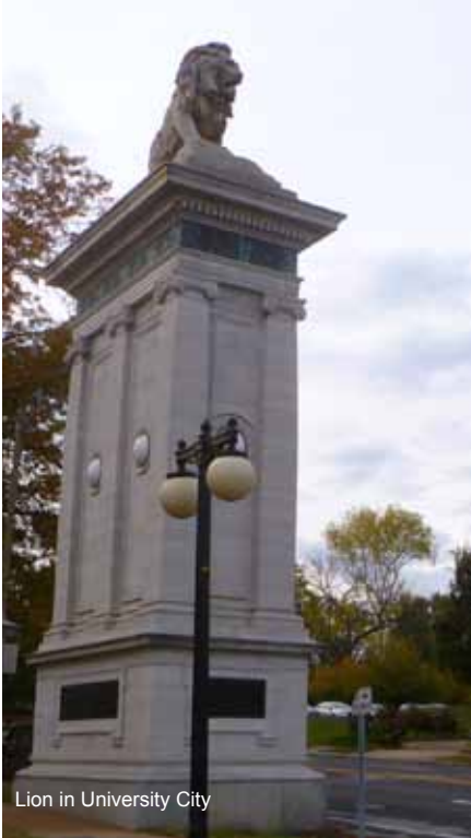
Lion in University City