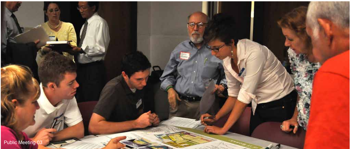
Public Meeting 03