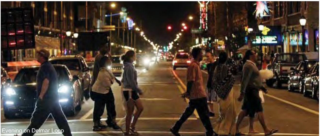
Evening on Delmar Loop

This REVISED DRAFT DOCUMENT takes into consideration comments received between July 25, 2012 and July 1, 2013