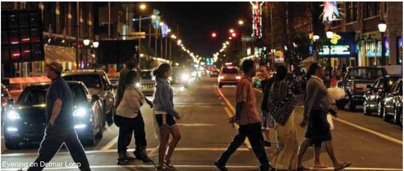
Evening on Delmar Loop

This REVISED DRAFT DOCUMENT takes into consideration all comments received by December 20, 2013