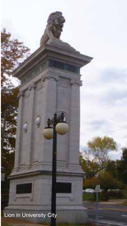
Lion in University City