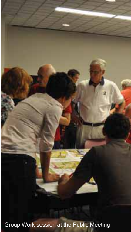
Group Work session at the Public Meeting

Connecting residents to existing and planned modes of transit is a major component of sustainable neighborhood development and a stated requirement of the grant award. Therefore, the project Study Area (Figure 3.2) incorporates the existing Delmar MetroLink station, extending one half block north of Olive Boulevard (north) to one half block south of Delmar (south) and from the centerline of Hodiamont Avenue (east) to one half block west of Kingsland Avenue (west). This study area includes the Parkview Gardens neighborhood as well as Washington University's North Campus, University City's Civic Center and part of the Cunningham Business Park. Since planning for these three areas does not fulfill the project goals, a smaller Detail Plan Area was established within the Study Area. The Detail Plan Area extends from one half block north of Olive Boulevard (north) to one half block south of Delmar (south) and from the centerline of North Skinker Boulevard (east) to the centerline of Kingsland Boulevard (west) (Figure 3.2, page 45) The Study Area sits within a larger Context Area that extends from roughly Etzel Avenue to the north, Forsyth Boulevard to the south, Hamilton Avenue to the east, and Big Bend Boulevard to the west. This Context Area covers all adjacent regional connections and amenities that are relevant to the Neighborhood Sustainable Development Plan (See Figure 1.1, page 41.)