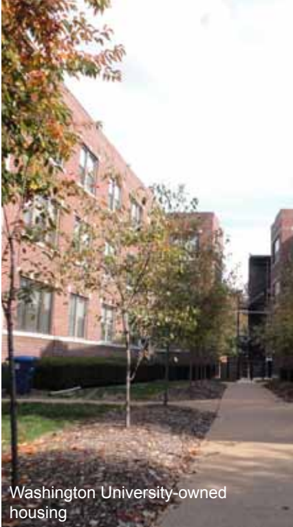
Washington University-owned housing