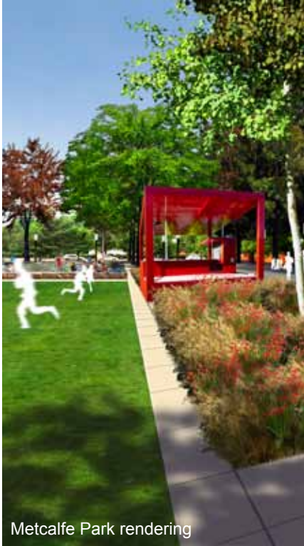
Metcalfe Park rendering

Connecting residents to existing and planned modes of transit is a major component of sustainable neighborhood development and a stated requirement of the grant award. Therefore, the project Study Area (Figure 3.2, pg.39) incorporates the existing Delmar Metrolink station, extending one half block north of Olive Boulevard (north) to one half block south of Delmar (south) and from the centerline of Hodiamont Avenue (east) to one half block west of Kingsland Avenue (west). This study area includes the Parkview Gardens neighborhood as well as Washington University’s North Campus, University City’s Civic Center and part of the Cunningham Business Park. Since planning for these three areas does not fulfill the project goals, a smaller Detail Plan Area was established within the Study Area. The Detail Plan Area extends from one half block north of Olive Boulevard (north) to one half block south of Delmar (south) and from the centerline of North Skinker Boulevard (east) to the centerline of Kingsland Boulevard (west)(Figure 3.2.) The Study Area sits within a larger Context Area that extends from roughly Etzel Avenue to the north, Forsyth Boulevard to the south, Hamilton Avenue to the east, and Big Bend Boulevard to the west. This Context Area covers all adjacent regional connections and amenities that are relevant to the Neighborhood Sustainable Development Plan (See Figure 1.1, page 27.)