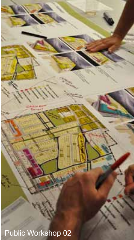
Public Workshop 02