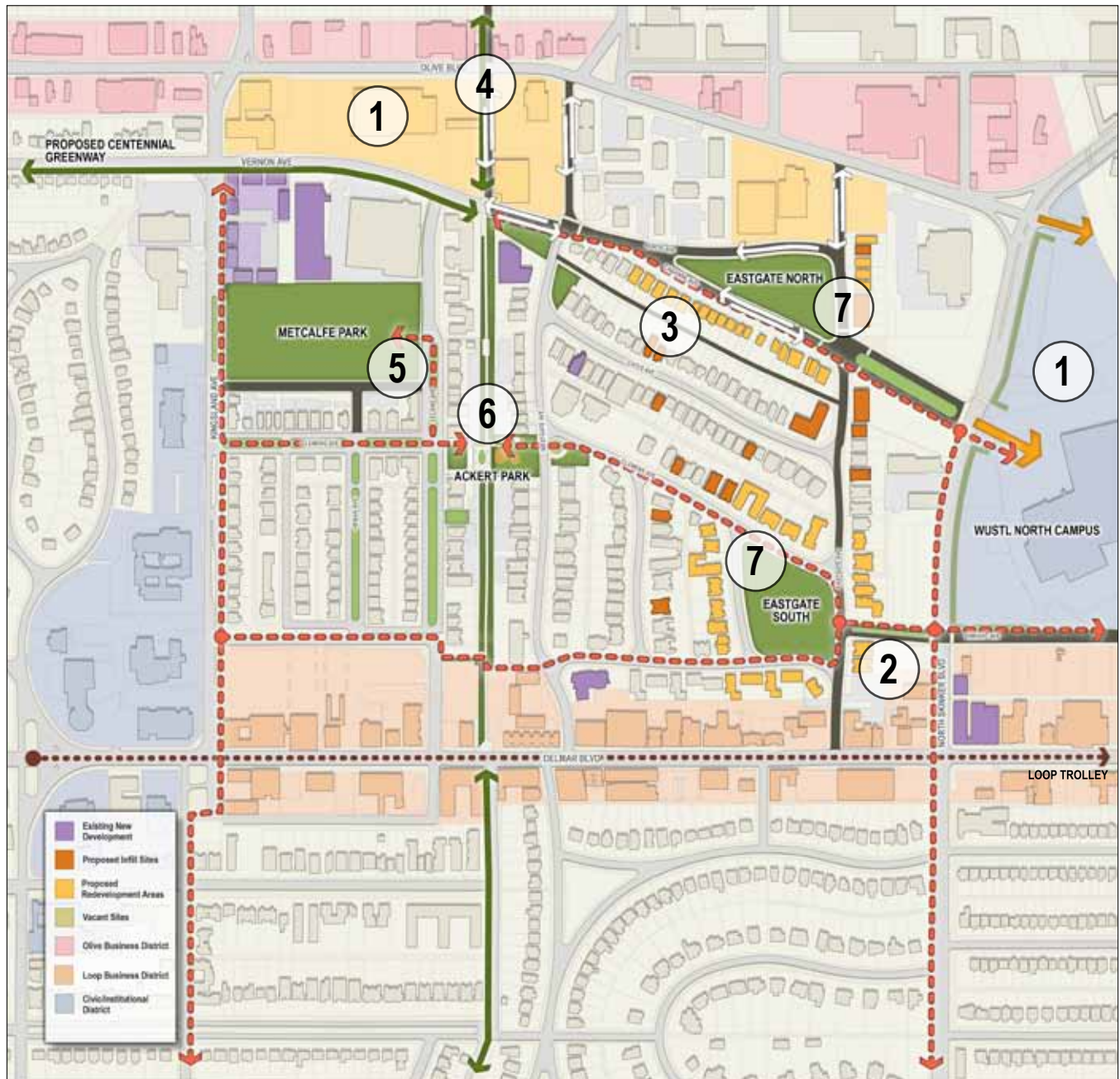
Figure 3.1: Parkview Gardens Parks and Open Space Plan (Adopted 2010)