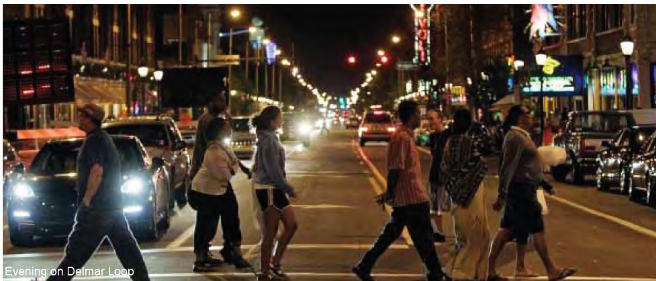
Evening on Delmar Loop

This revised DRAFT DOCUMENT takes into consideration comments received before June 15, 2012